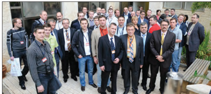
Russian Radiologists visit Rabin Medical Center

In early 2010, Rabin Medical Center's Interventional Radiology Unit, a state of the art facility that specializes in innovative minimally invasive procedures as alternatives to traditional surgery, hosted a conference for more than 100 radiologists from over 70 vascular centers in Russia. This event also included an international forum of world renowned radiologists from the USA and Turkey. The week long gathering addressed all the modern aspects of neuroradiology and endovascular radiology, including the latest treatments available in both fields.