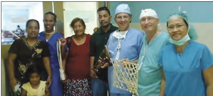
Rabin Medical Center doctors with Patients in Micronesia