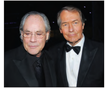
L-R Robert Klein & Charlie Rose

More friends than ever attended the 2009 annual gala. They gathered on November 2, 2009 to support the medical center named after Yitzhak Rabin, aboard the USS Intrepid, where the former Prime Minister made his last American speech nearly fifteen years before. Charlie Rose presided over the festivities, which included musical numbers from the cast of Memphis , the musical, a performance by Savion Glover , the Tony award winning tap dancer, and the wry comic stylings of Robert Klein .