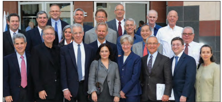
Oncologists from around the world gather at Rabin Medical Center

The Rabin Medical Center hosted a symposium on prostate cancer entitled "Update and Future Perspectives" as part of its fourth annual Davidoff International Board meeting in May 2010. Beyond serving as an opportunity to share research, this symposium brought forth innovative ideas about advancing the Davidoff Center, and further collaboration with cancer centers abroad.