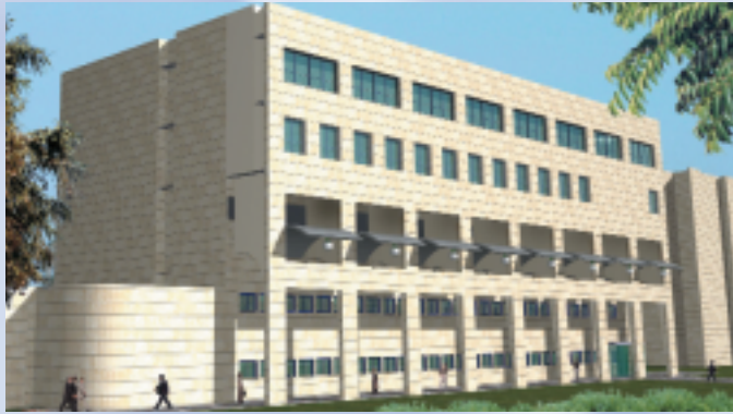
The future Genetics Institute at Rabin Medical Center

Scheduled to open in November 2006, the new two-story institute will have the most modern up-to-date clinics and laboratories, with state-of-the-art equipment and medical tools for diagnostic genetic testing. Directed by Prof. Mordechai Shohat , the institute will provide comprehensive genetic services and include: genetic clinics, genetic counseling, comprehensive cytogenetic services, diagnostic services in molecular genetics, and biochemical survey tests for prenatal diagnosis—all at levels that were previously impossible.