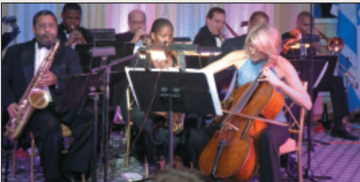
Paula Zahn playing the cello with the Jazz Museum's Harlem All Stars Band