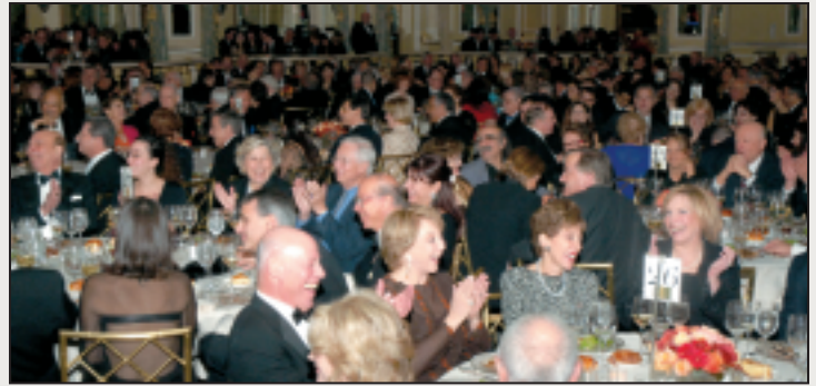
Over five hundred and forty supporters of Rabin Medical Center gathered at the Pierre