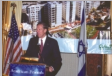
The Honorable George Pataki, Governor of the State of New York and Honorary Dinner Chair