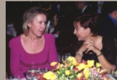
Libby Pataki, Honorary Dinner Co-Chair and Nava Barak