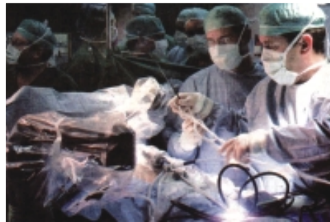
Physicians and technicians in the operating room change the robots tools on direction of the operating surgeon.

leaders, who sought to find a solution for the wounded soldiers on the battlefield, who, with the aid of a robot could get top medical care from many miles away. Recently this became a reality when an operation was performed in Paris, France, using a robot located in the U.S.A.