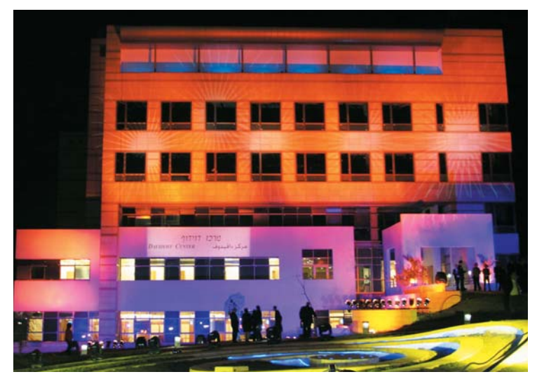
The Davidoff Center shines brightly over the State of Israel.