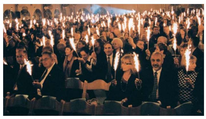
1,100 rays of light at the Davidoff Center opening

The Davidoff Center represents a major milestone for cancer patients in Israel. Rabin Medical Center is proud to be considered a leading partner in the global fight against cancer.